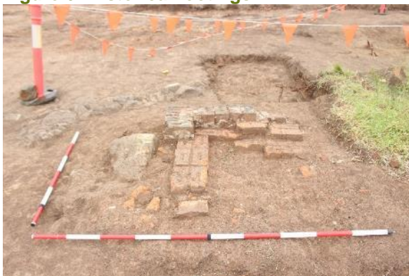
Figure 6: Historical footings