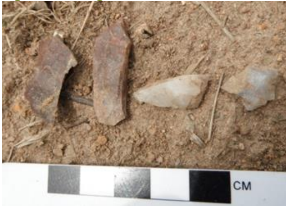
Figure 4: Aboriginal stone tools