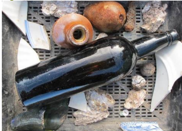
Figure 5: Historical artefacts