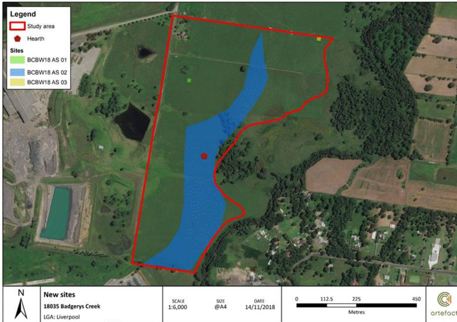
Figure 2: Location of newly identified sites in the study area