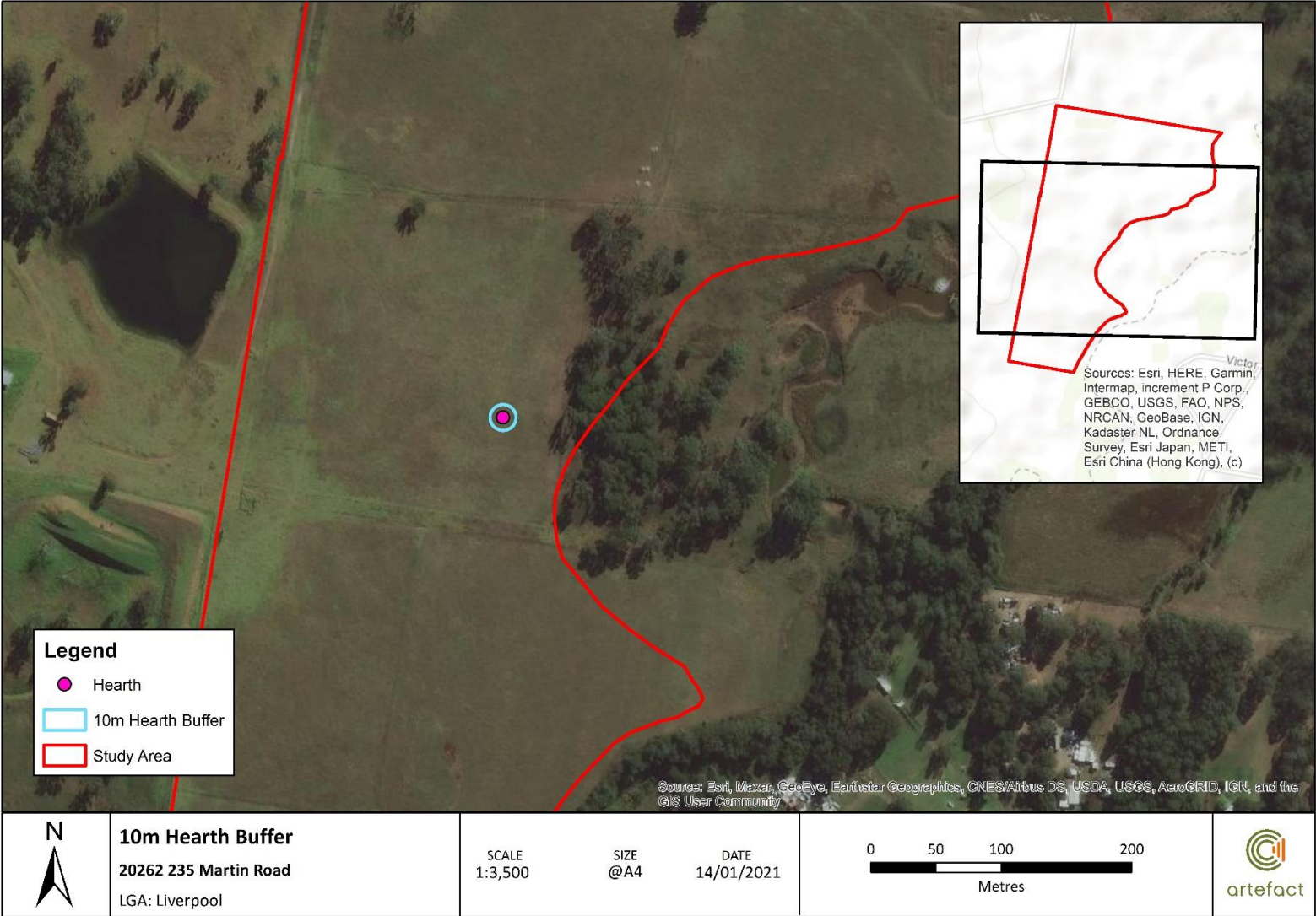
Figure 3: Location of heat retainer hearth feature (enlarged) and 10m buffer in BCBW18 AS 02 (AHIMS ID 45-5-5164)

Document Path: D:\GIS\GIS_Mapping\20262_235_Martin_Road\MXD\HMP_10m_Buffer_20210114.mxd